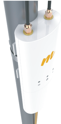
C5C-EF on Pole