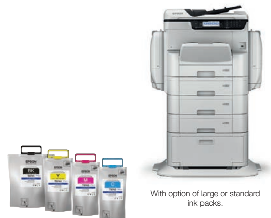
With option of large or standard ink packs.