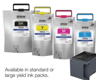
Available in standard or large yield ink packs.

With Epson's Replaceable Ink Pack System (RIPS), exorbitant printing costs are a thing of the past. The revolutionary RIPS features four ink supply units and a waste ink box, giving you uninterrupted printing of up to 86,000 pages in black or up to 84,000 pages in colour. With such page yields, you enjoy maximum cost savings and minimum running costs.