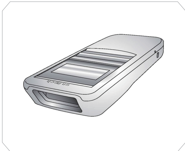
The unitech Wireless(BT) Pocket Laser Scanner